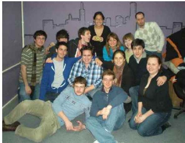
The Chicago Room at Kyiv Hillel