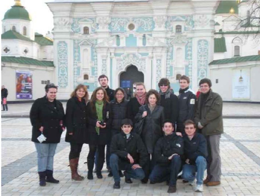
Program participants in Sofiyaskaya Square

Stanford University students joined students in Kyiv, Ukraine for a week-long leadership program focused on advocacy and cross-cultural dialogue. The week-long seminar paired American and Ukrainian students as roommates, fostering friendships and long-term ties. Together they explored their Jewish identity and how to build Jewish communities, confront anti-Semitism and promote democracy. NCSJ, in conjunction with Hillel at Stanford and Kyiv Hillel coordinated the program, as part of a three-year project supported by grants from the Koret Foundation, Taube Foundation for Jewish Life and Culture and the Jewish Community Federation of San Francisco.