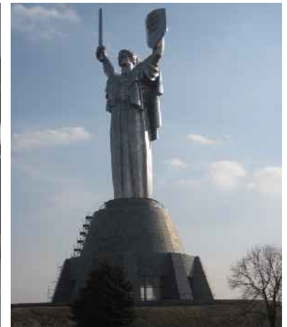
Mother Motherland Monument