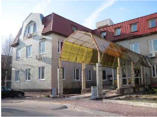
Hesed Nakhalat Avot Azriel