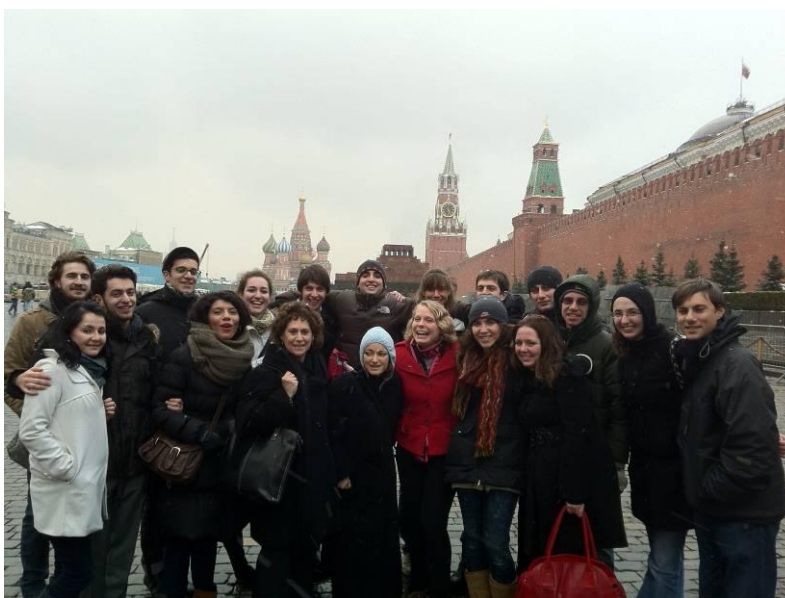
Program participants in Red Square, Moscow

NCSJ, an advocate for Jewish communities in the successor states of the former Soviet Union (FSU) for forty years, provided the program with a unique and critical perspective about government and community-level Jewish life and institutions. Stanford University Hillel provided professional staff assistance in selecting and preparing the American participants and Moscow Hillel helped to coordinate the program in Moscow. The Taube Center for the Renewal of Jewish Life in Poland coordinated the program in Warsaw.